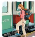
4 take a train