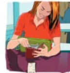
7 pay the bill