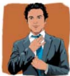
3 wear a suit