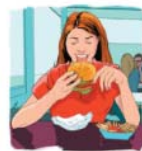
6 enjoy a meal