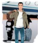
2 carry bags