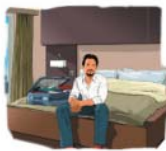
1 stay in a hotel

a Listen and repeat the verb phrases in 1–8.