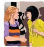
8 have fun

b Complete the phrases with a verb from a.