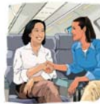
5 meet new people